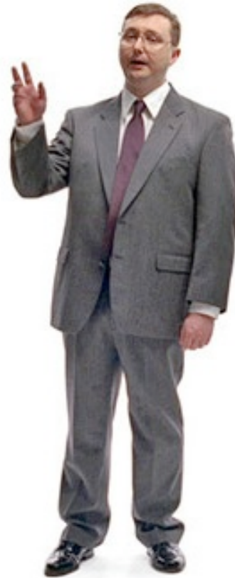
I'm a PC.