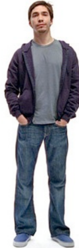
I'm a Mac.